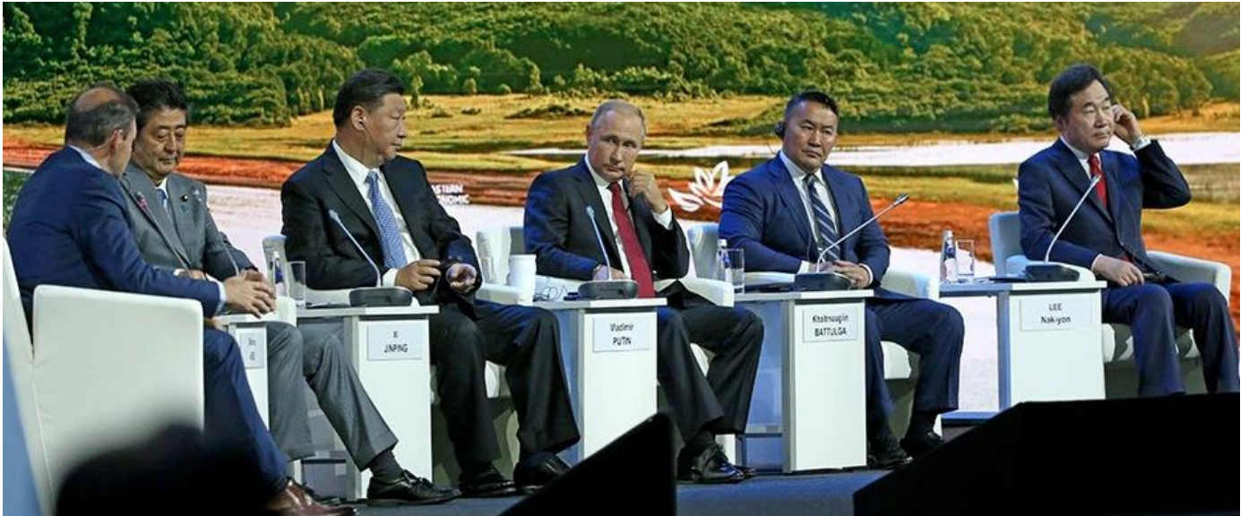
President Battulga together with Prime Minister Abe and leaders from China, Russia and Korea at the Eastern Economic Forum in Vladivostok in September, 2018